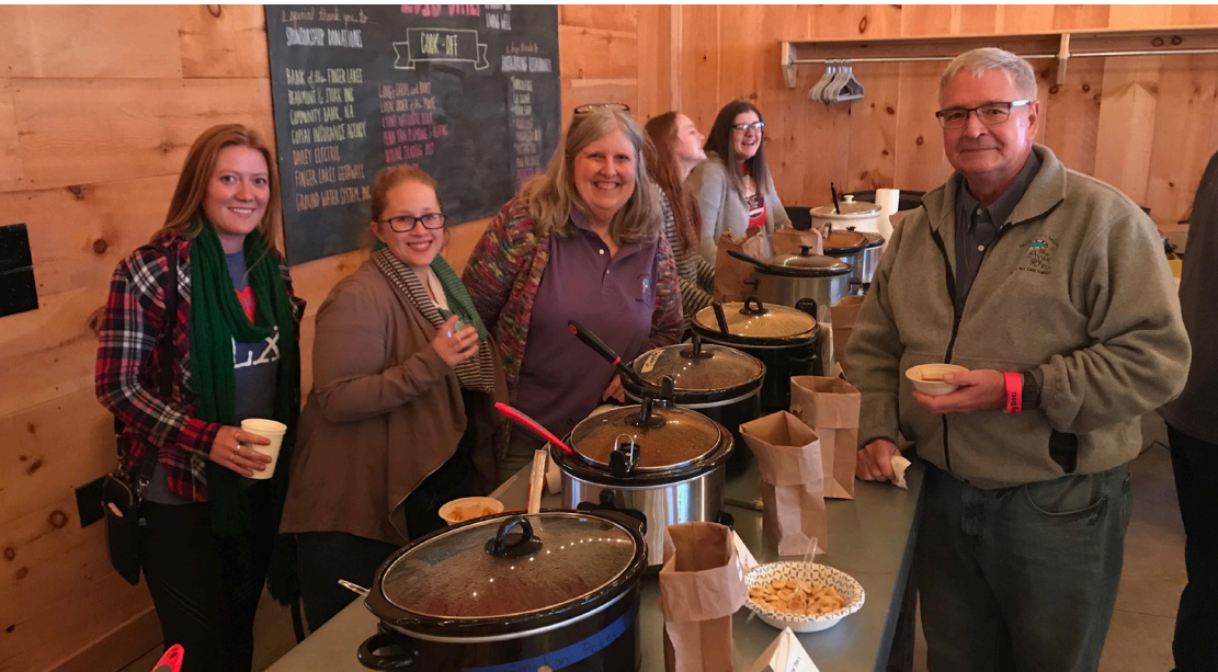
Check out our new website where you can find the programs we offer and ways to donate and volunteer! JOIN US.