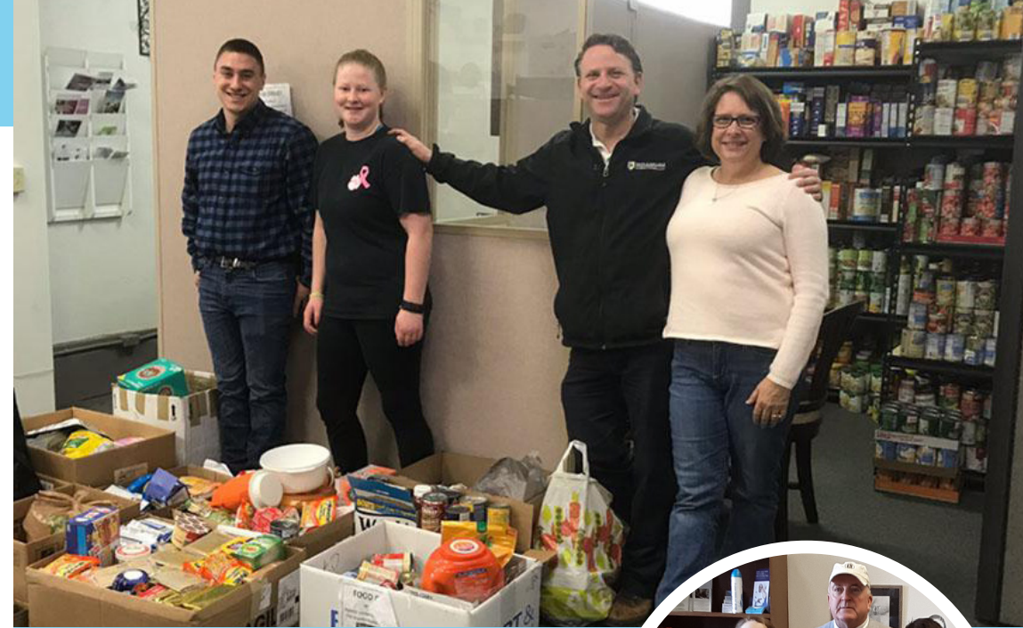
Above: Donations from the Center for Spiritual Life at Keuka College. Right: Fourth grade students from St. Michael School bring in pantry donations.

Caregivers and those living with memory loss are invited to join us for social time.